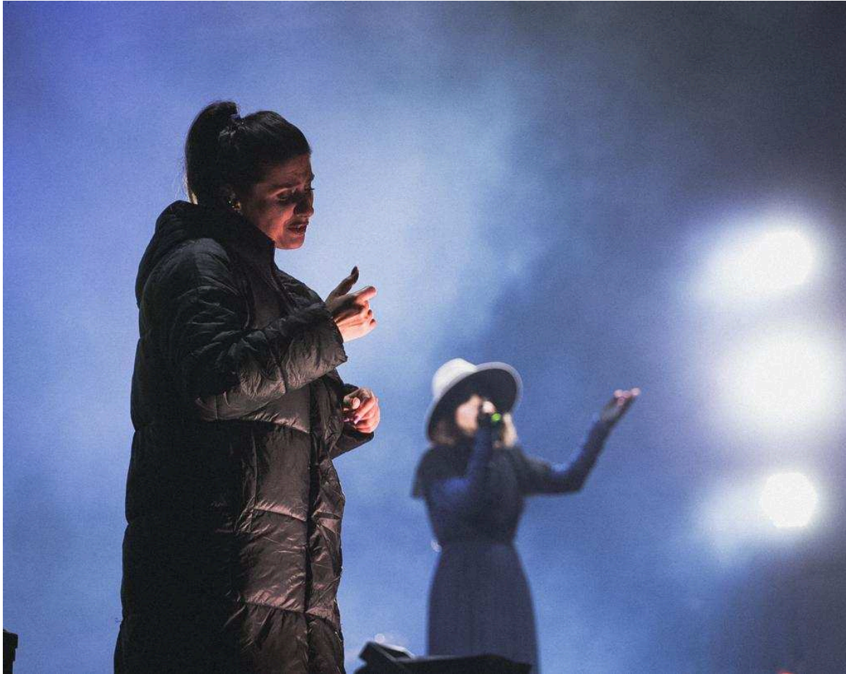
Neverending Timișoara 2023 - Katie Melua Concert Unirii Square