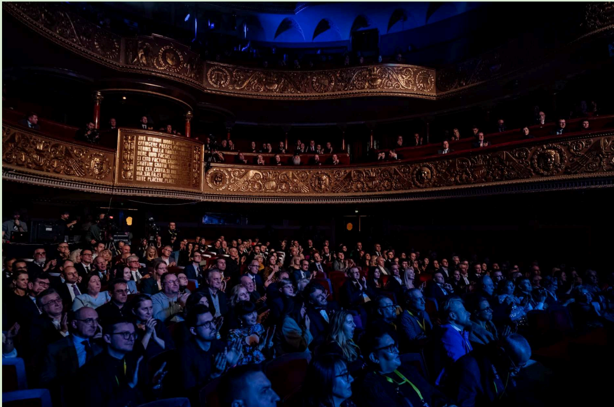
Neverending Timișoara 2023 - Closing Gala | The Great Hall of the "Mihai Eminescu" National Theatre Timișoara and the Romanian National Opera Timișoara