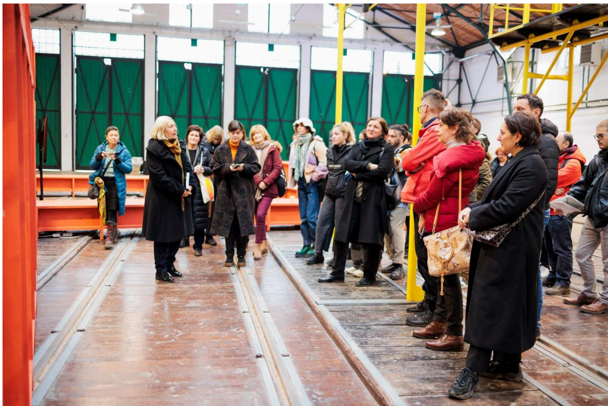
Neverending Timișoara 2023 - ZONA& MX- “Corneliu Mikloși” Museum