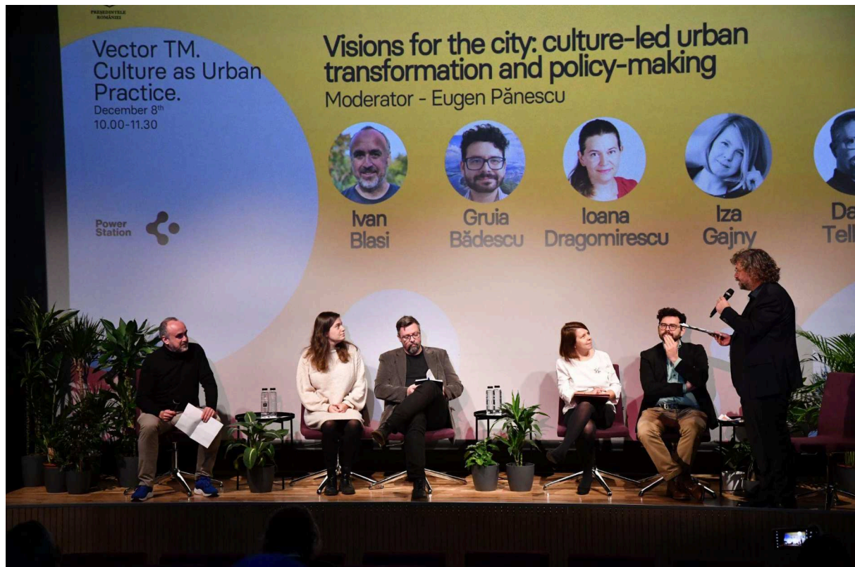
Neverending Timișoara 2023 - VECTOR TM International Seminar Culture as Urban Practice Victoria Cinema