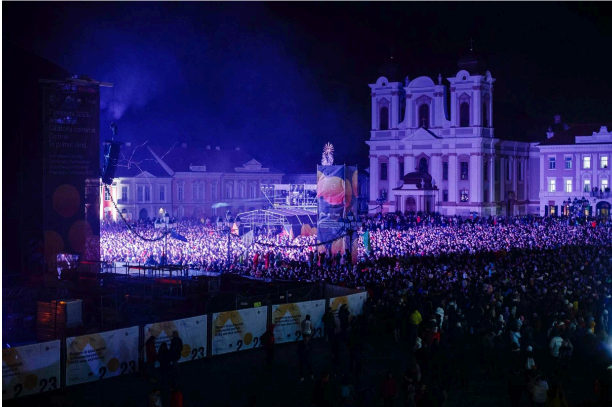
Neverending Timișoara 2023 Unirii Square

For four days, Neverending Timișoara 2023 managed to bring the whole community together in celebrating a historic moment in the life of the city: the symbolic closing of the "Timișoara 2023 European Capital of Culture" Programme. The more than 100 events included in the official "Neverending Timișoara 2023" programme, the concerts - some of them premiered not only in Timișoara but also in Romania, with international artists such as Katie Melua, Róisín Murphy, Jessie J, and Klangphonics placed Timișoara on the European cultural map. More than 115,000 spectators participated in the Neverending Timișoara 2023 events, highlighting the unique force of culture in bringing the community together.