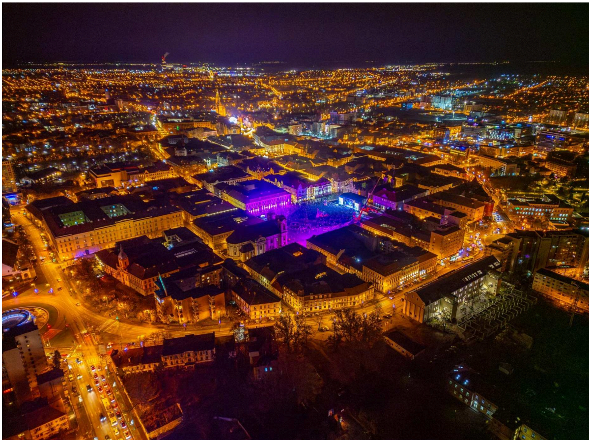
Neverending Timișoara 2023 - Concerts in Unirii Square