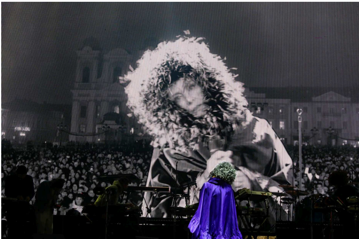
Neverending Timișoara 2023 - Roisin Murphy Concert, Unirii Square

Timișoara's year of transformation ended with a spectacular event between December 7 and 10, 2023: Neverending Timișoara 2023. This multifaceted celebration aimed to encapsulate the richness and impact of the cultural journey undertaken throughout the 2023 cultural year.