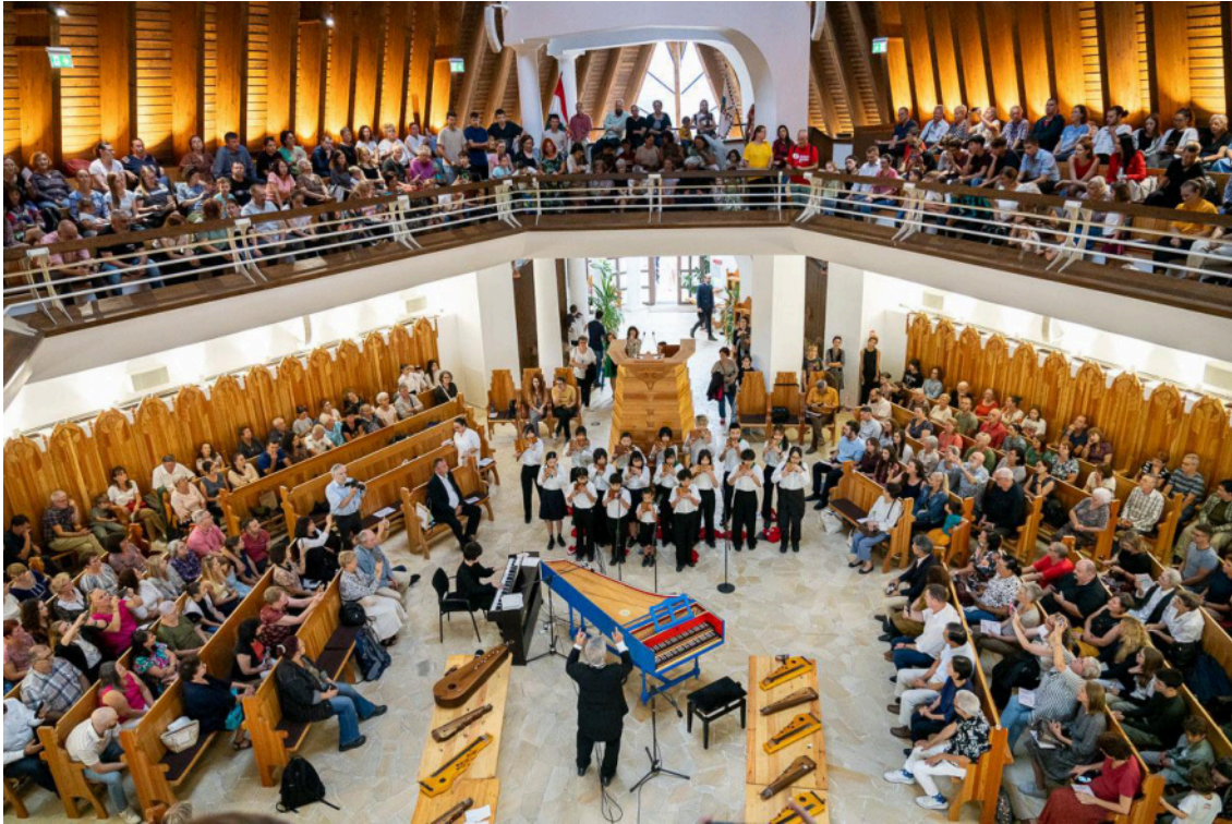
Photo: Senda Panflute children's choir concert | International Music Festival for Youth (September 19, 2023, New Millennium Reformed Center)