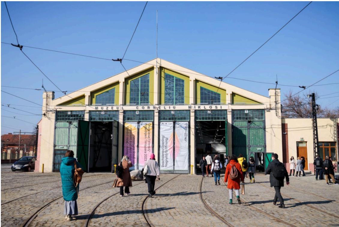
Central collective exhibition "Chronic Desire - Sete cronica" (MX - "Corneliu Miklosi" Museum) | Opening Timișoara 2023 | Photo: Petru Cojocaru

In 2023, the Bastion galleries 1, 2 and 3 (the eastern body of the Maria Theresia Bastion), the courtyard and the ground floor of the Center for Projects (1 Vasile Alecsandri St.), Gallery 5 (1 Vasile Alecsandri St.), MX - The "Corneliu Miklosi" Museum (83 Take Ionescu Blvd.), the Stefania Palace (1 Romans' Square - Traian) hosted over 150 exhibitions, art installations, workshops, debates, book launches and various performances, involving over 48,000 participants.