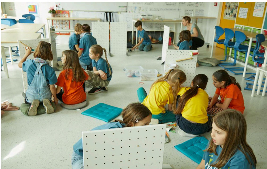
“Science through Art” workshops at Babel School and High School

The projects in the “Creative Partnerships” area of the programme propose artistic and educational-cultural activities that start from a creative partnership between the parties, in which the initiators collaborate at all stages and access various resources to carry out the activities. The “Creative Spaces” thematic area creates opportunities for artistic or adaptive interventions in and on school premises, i.e., educational activities outside school in cultural spaces. The third thematic area, “Creative Resources,” focuses on providing teachers with training, professional community development, and resource activities related to cultural education and arts in education.