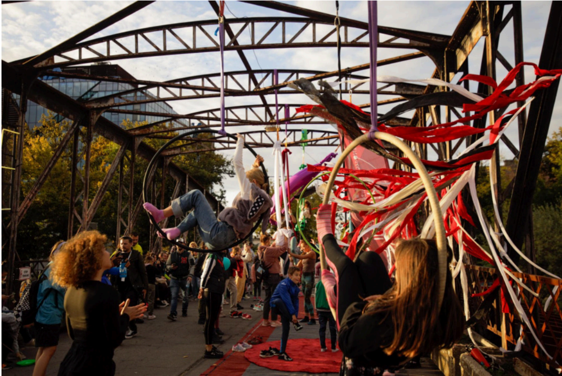
Flight Cirkus Jam (Hungary) at the Iron Bridge, as part of "Timișoara 2023. City Celebration" (October 6-8, 2023)

Timișoara 2023. City Celebration was one of the most complex events of the year in Timișoara.