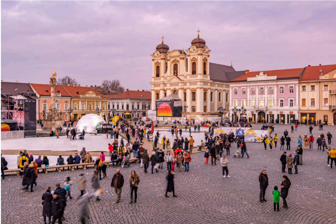
Piața Unirii / Union Square, work in progress for the concerts of the Timișoara 2023 Opening event

they spotlighted the city neighborhoods and their people and brought the various city communities of the city together.