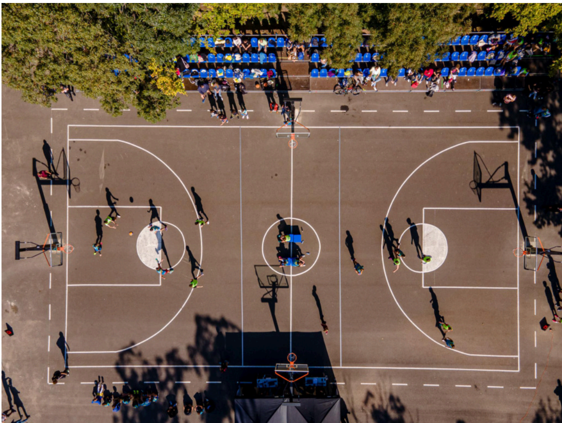
The 3x3 basketball tournament "Timișoara 2023. City Celebration" in Ușoda.

Through rugby, rock climbing, water sports, soccer, dance, running, weightlifting, volleyball, fencing, American football, squash, martial arts and many other sport activities, the 2023 edition of the City in Motion funding programme brought sport close to the community and continued the tradition of Timișoara for performance in sport.