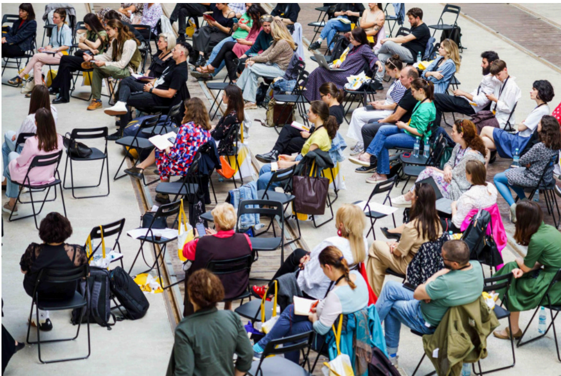
Meeting of TM2023 Platform – Power Station (May 31, 2023, MX – “Corneliu Miklosi” Museum)

Funded applications (projects, grants and mobilities): 337