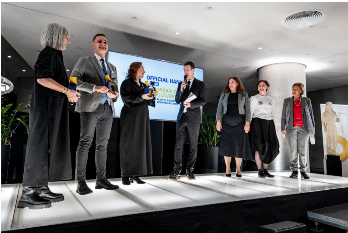
The ceremony of handing over the title of European Capital of Culture to the 3 cities holding the title in 2023 (Athens, January 9, 2023)

Starting in 2022, the taking over of the title by the following cities is marked by a baton handover ceremony that brings together representatives of the European Commission with political representatives and the teams implementing cultural programmes.