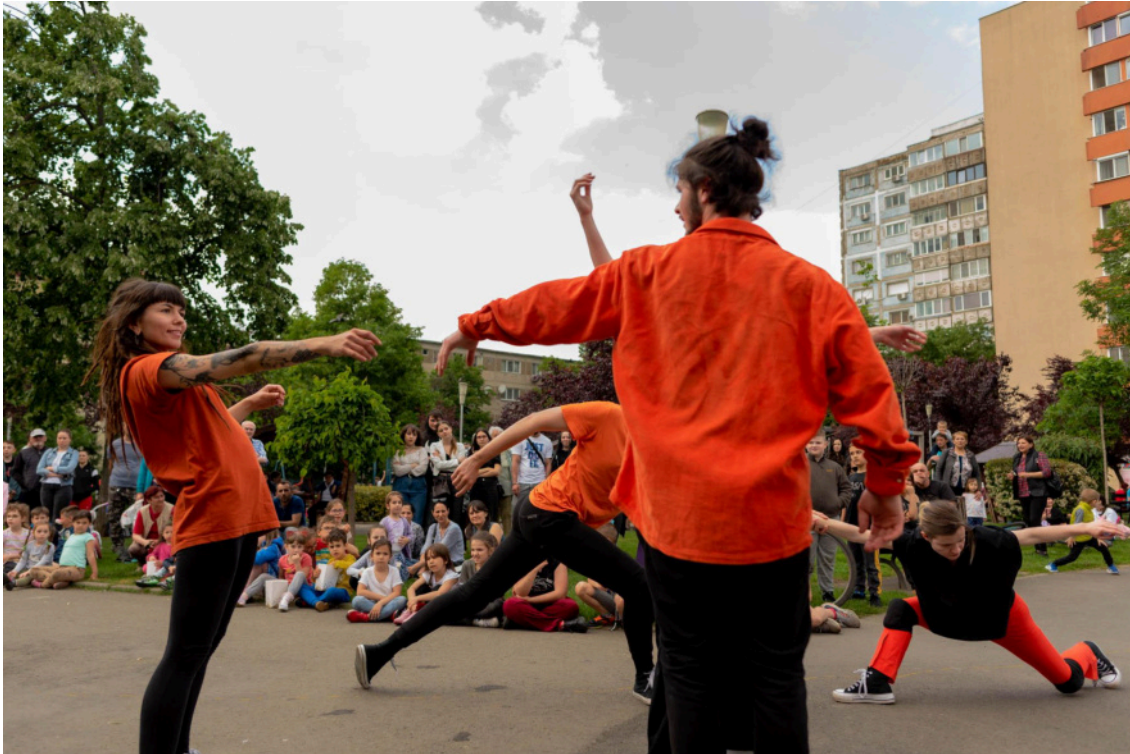
"Nomad Dance" - Unfold Motion, in Dacia Park (2023)