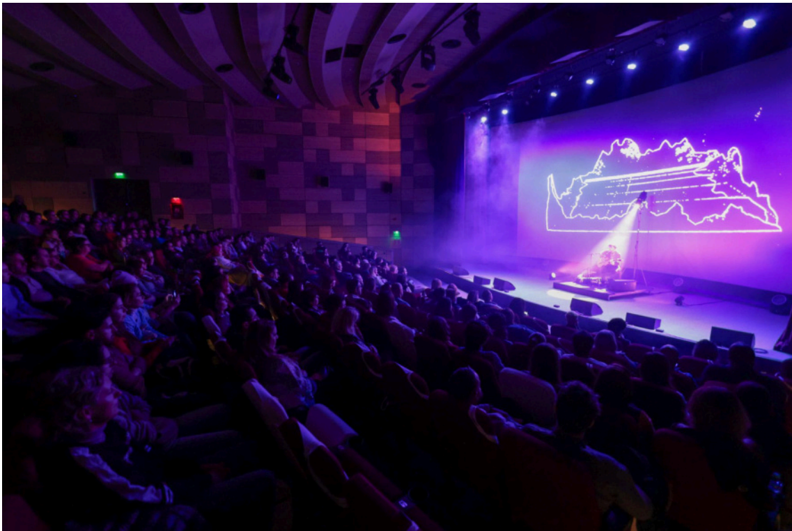
José González concert at Cinema Timiș, as part of "Neverending Timișoara 2023" (December 9, 2023)

In the fall of 2023, the Timis Cinema hall also resounded with music: from local or national artists with jazz or blues rhythms, to the chords of Swedish guitarist José González, within the event Neverending Timișoara 2023, and from live concerts to screen concerts of some beloved international artists, presented exclusively in our city.