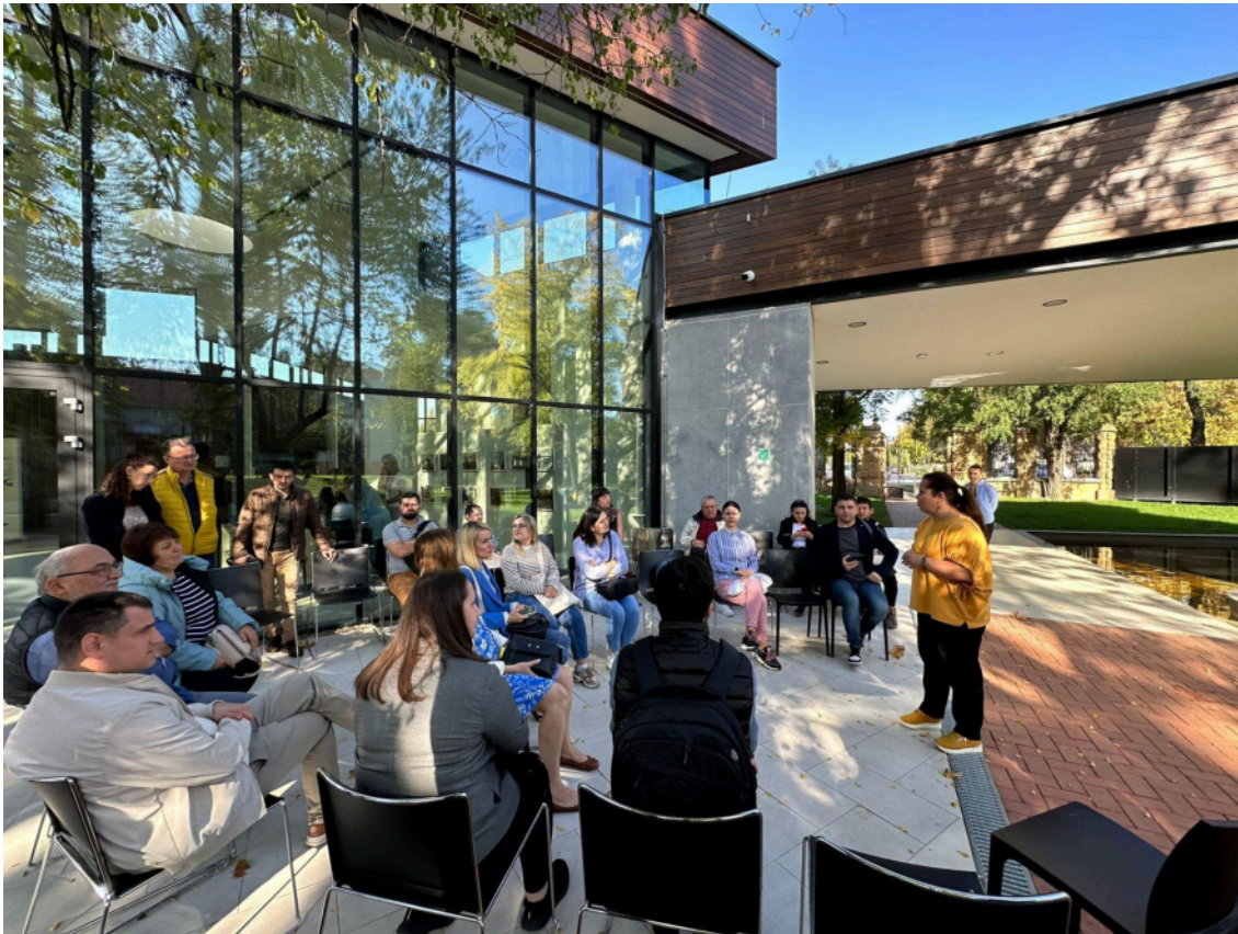
A visit to the Water Museum as part of the exchange of experience "Better cities, with culture at work"

After the visit to Timișoara, under the title "7 inspirational ideas from the European Capital of Culture 2023 regarding integrated urban development" , the guests from Moldova published online the synthesis of the exchange of experience "Better cities, with culture at work".