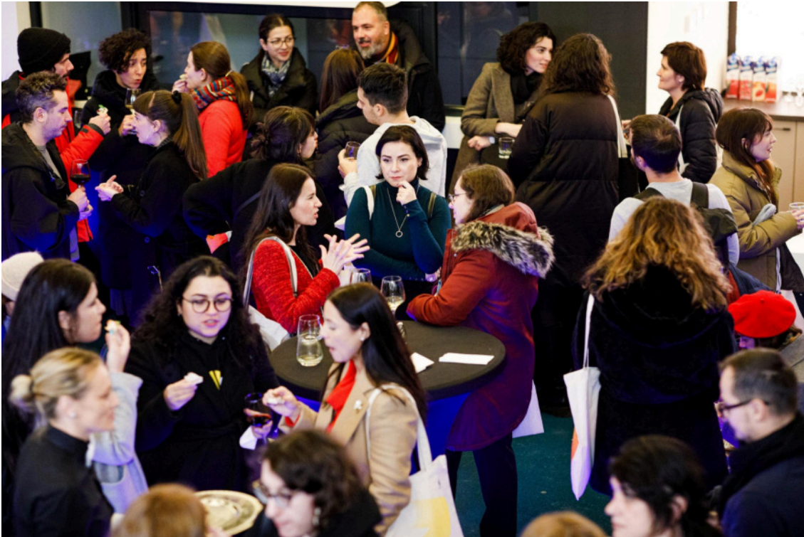
Photo: Timișoara Community Gala 2023 | "Neverending Timișoara 2023" (7-10 December 2023), Cinema Timiș