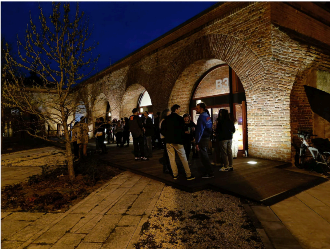
Photo: Indecis la Bastion 3

During the year, the Center for Projects opened these spaces to the community in partnership with organisations and individuals active in the fields of culture, education, youth, environment, etc., who activated them through various events.