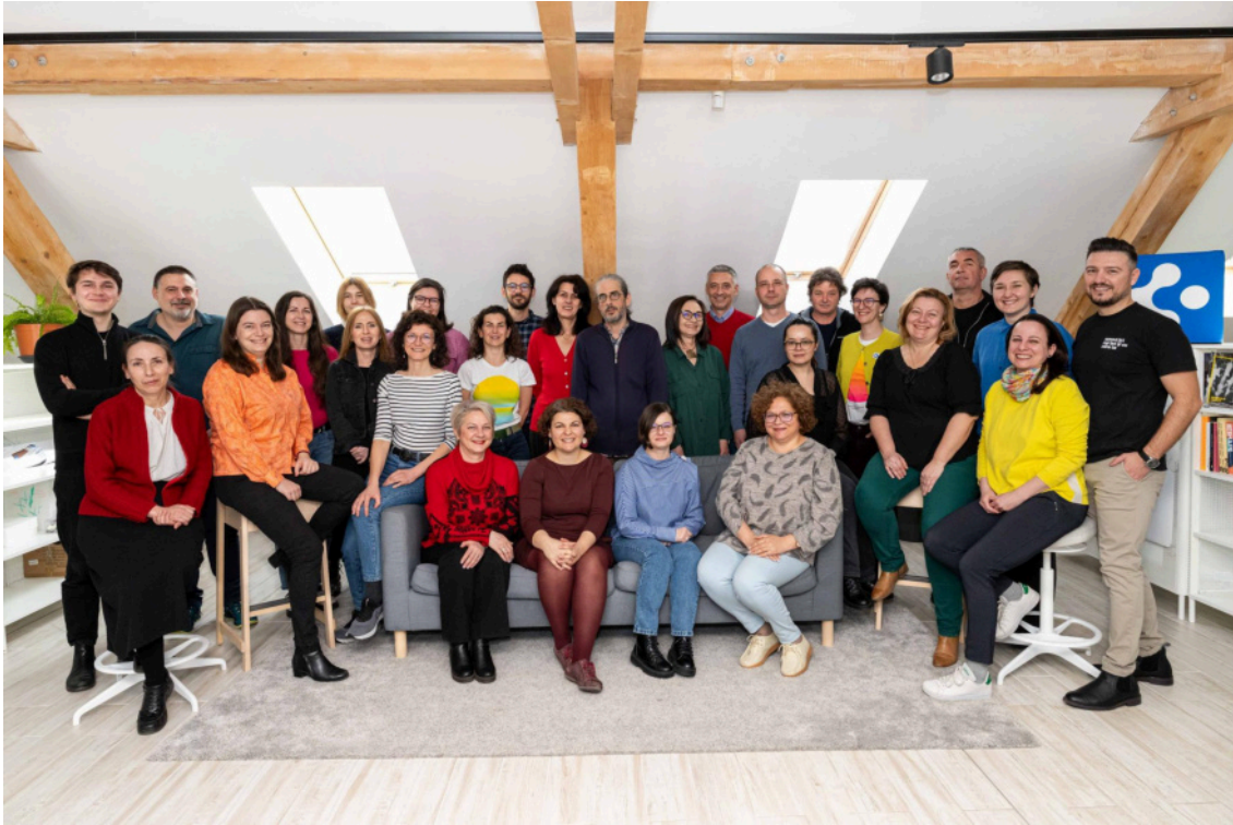
The team of the Center for Projects of the Municipality of Timișoara

centruldeproiecte.ro contact@centruldeproiecte.ro +40787.287.100