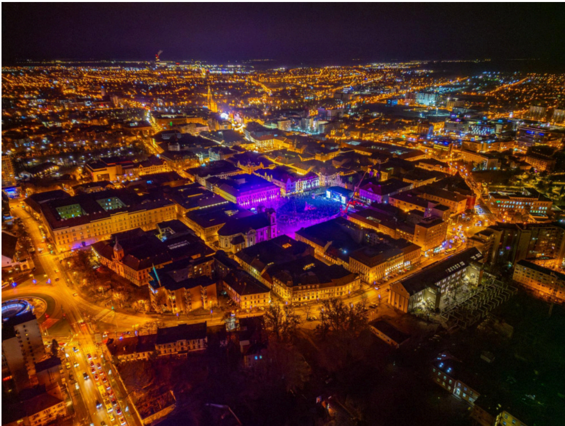
Neverending Timișoara 2023 - Concerts in Union Square

The purpose of the programme is to protect and support cultural life as a development vector of resilient, adaptable and solidary communities.