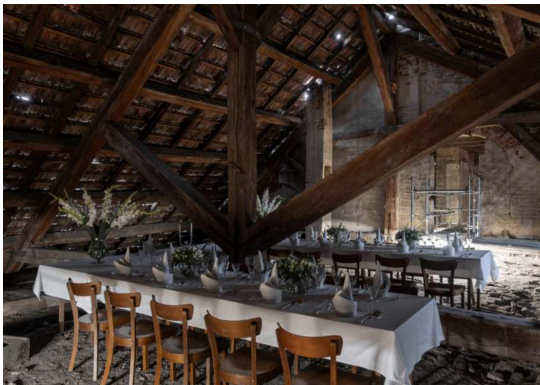
BETA - Timisoara Architecture Biennial – OAR Timișoara, at the Garrison Command