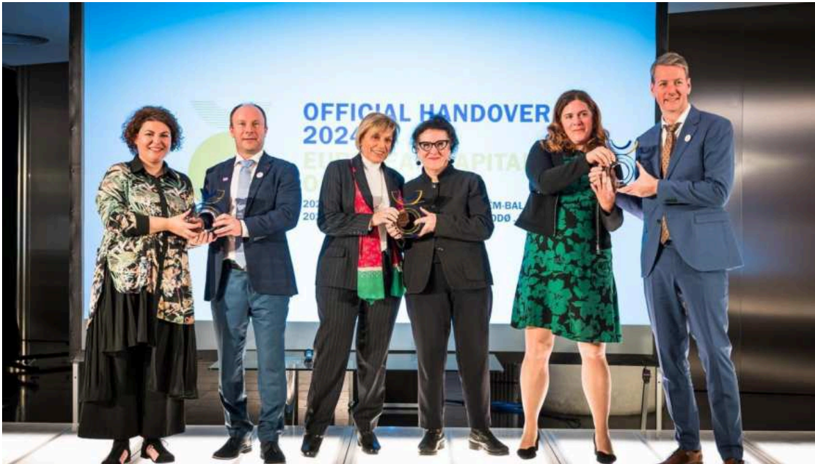
The handover ceremony of the European Capital of Culture (ECoC) title to the three cities holding the title in 2024 (Athens, 11 January 2024), Photo: John Kouskoutis