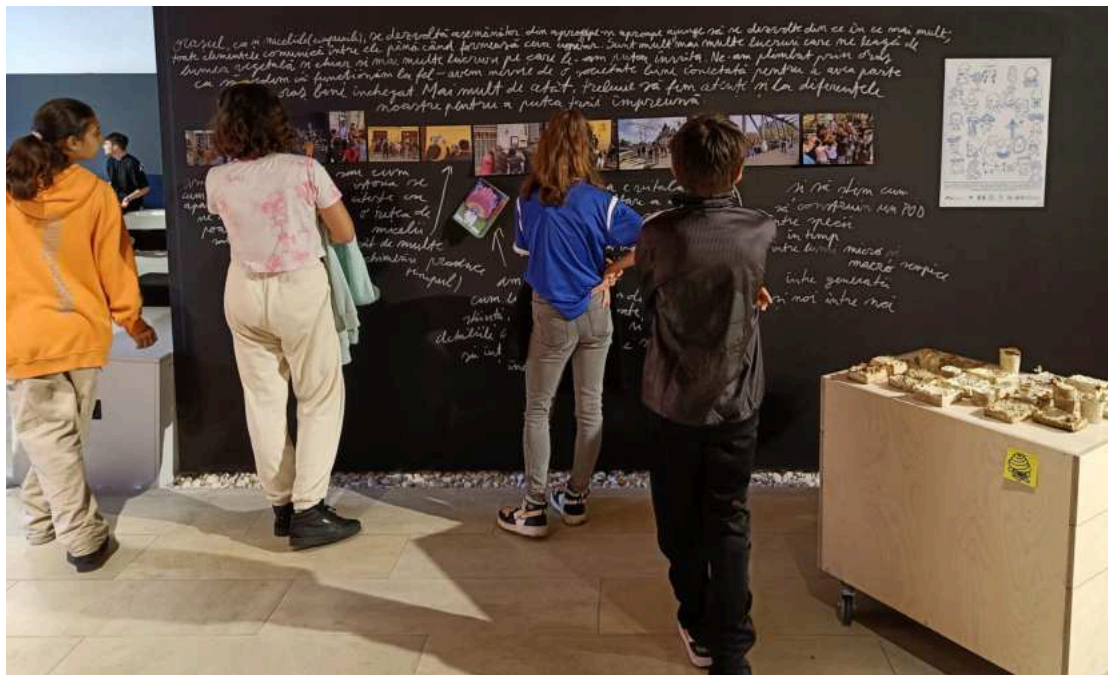
Indecis (Undecided), at Bastion 3