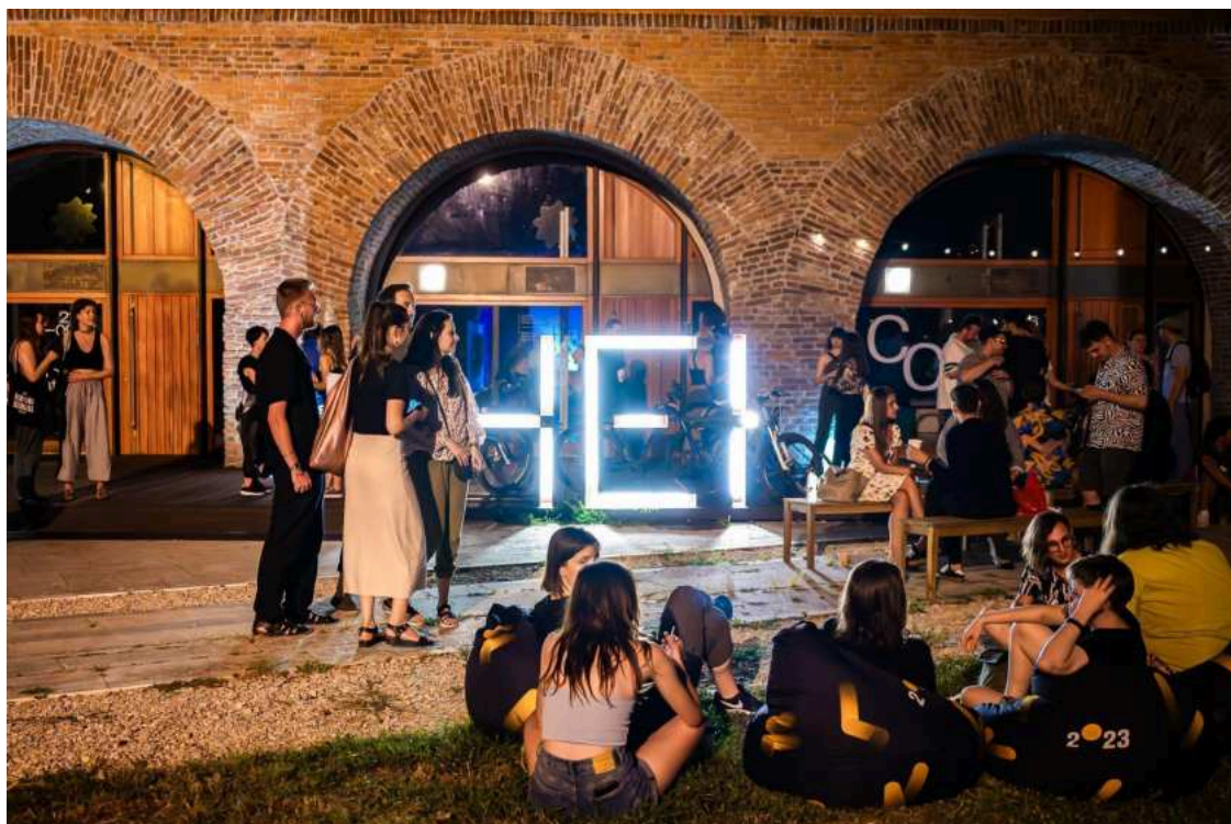
HEI | House of European Institutes - The Romanian-German Cultural Society of Timișoara, at Bastion 1