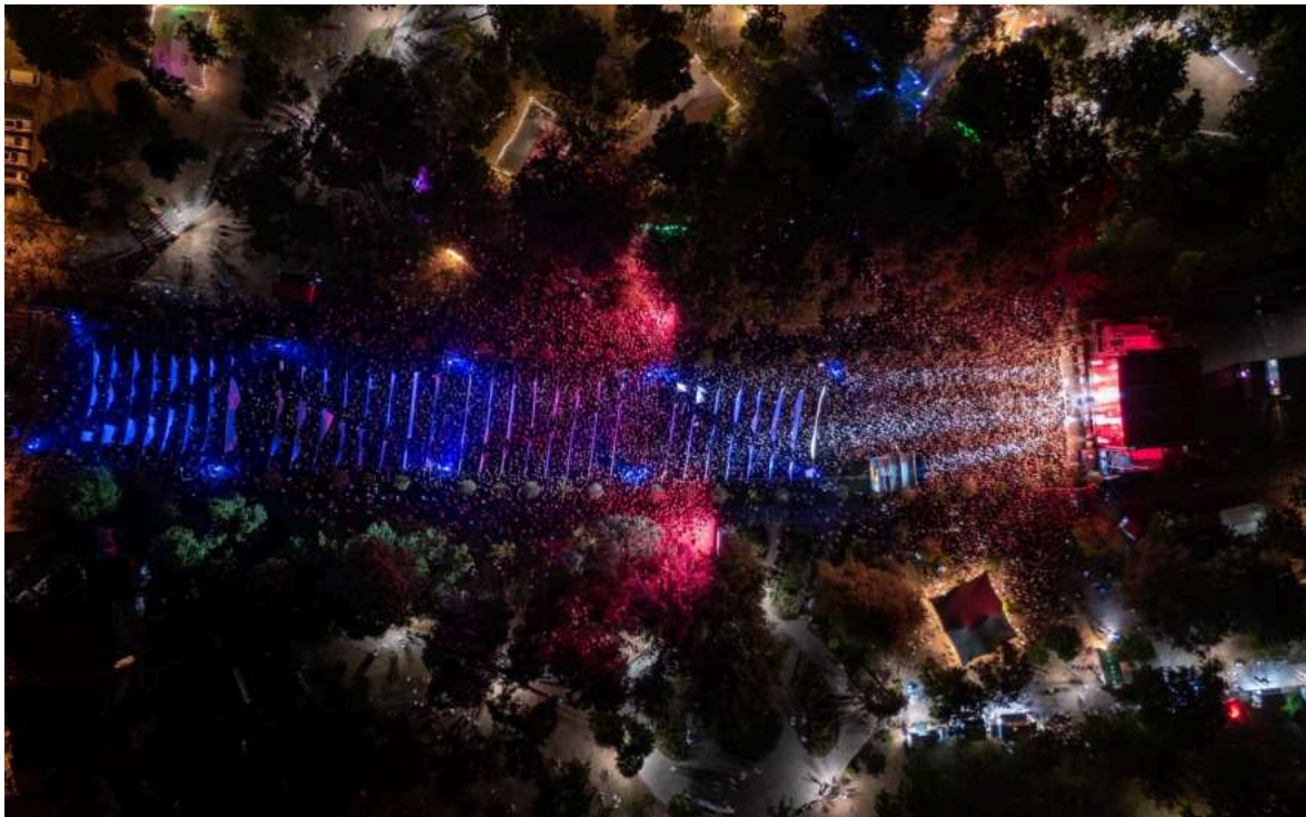
City Celebration 2024, I.C. Brătianu Blvd.

City Celebration is an event funded by the Municipality of Timișoara , coordinated and organised by the Center for Projects .