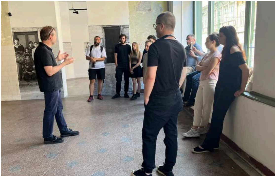
Voyage en Roumanie by Mathieu Pernot, Stefania Palace| Source photo: The French Institute Timișoara