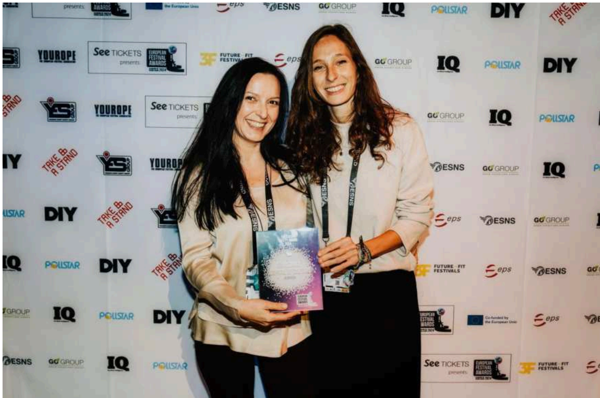
European Festival Awards

This recognition highlights the high safety and organisational standards of “ Neverending Timișoara 2023 .”