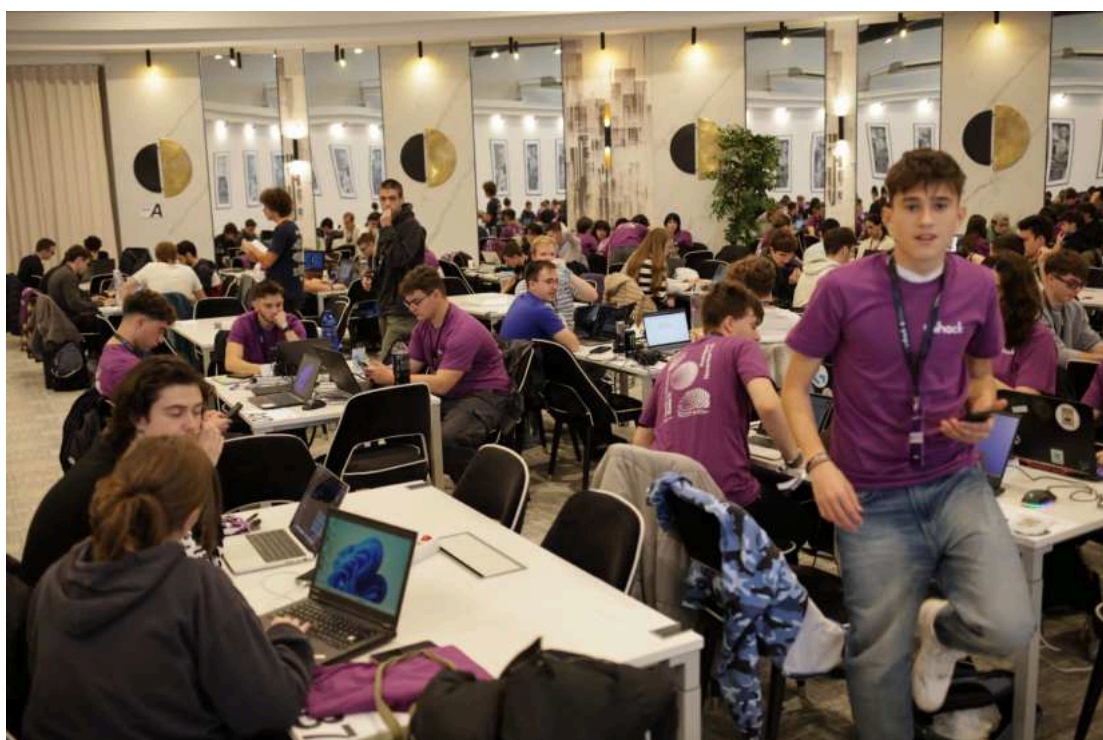
UniHack – The Students' League of the Faculty of Automation and Computers in Timișoara, at CRAFT Featured: "Cinema Summer School" – Identity Education Association, at Cinema Victoria