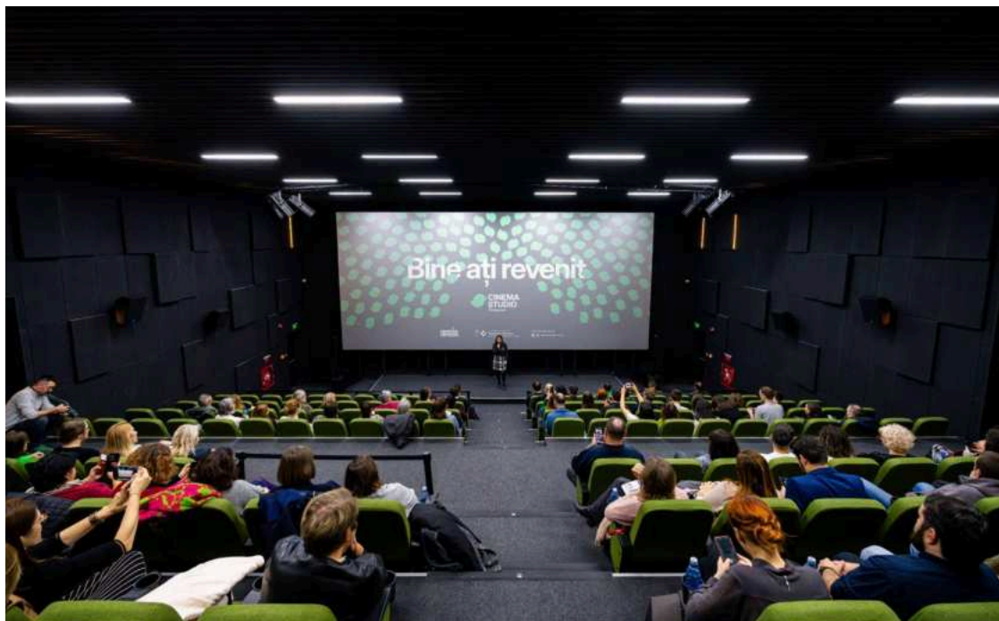
Cinema Studio

2,818 spectators crossed its threshold during the reopening weekend and the two weeks that followed, dedicated to the special programme "35 Years of Freedom: Historical Sequences on the Big Screen" – an opportunity to bring to the screen of the city's newest arthouse cinema a selection of 16 emblematic Romanian films about the Revolution and the post-communist transition.