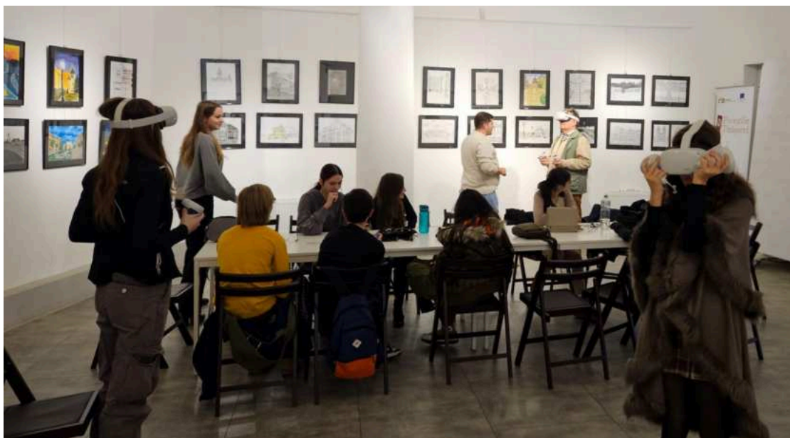
The Stories of Timișoara – Podium Association, House of Culture Timișoara