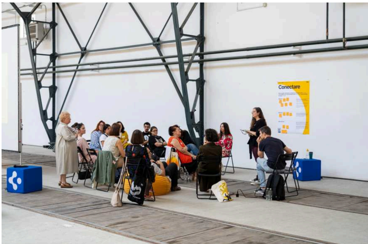
The TM2023 Platform, at MX – Corneliu Miklosi Museum