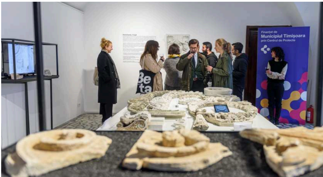
Heritage | Fragile - Prin Banat, la Galeria 5

Galeria 5 is an unconventional space of 59 square metres that housed a barbershop for many years. Despite its modest size, the space became, over the past year, a meeting point between cultural operators and the public. In 2024, Galeria 5 hosted 16 events, drawing a total of 7,624 participants.