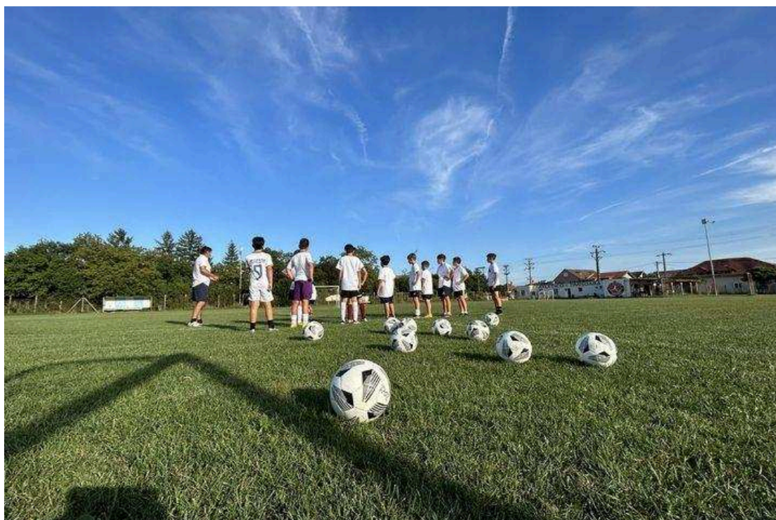
We move the community – Football for all – Atletico Timișoara Sports Club Association, at Voința Stadium