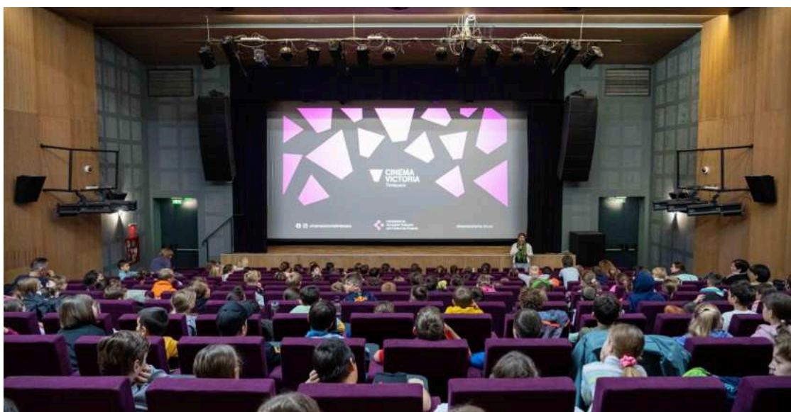
Cinema Victoria

The cinema has been part of the Europa Cinemas network since 2024.