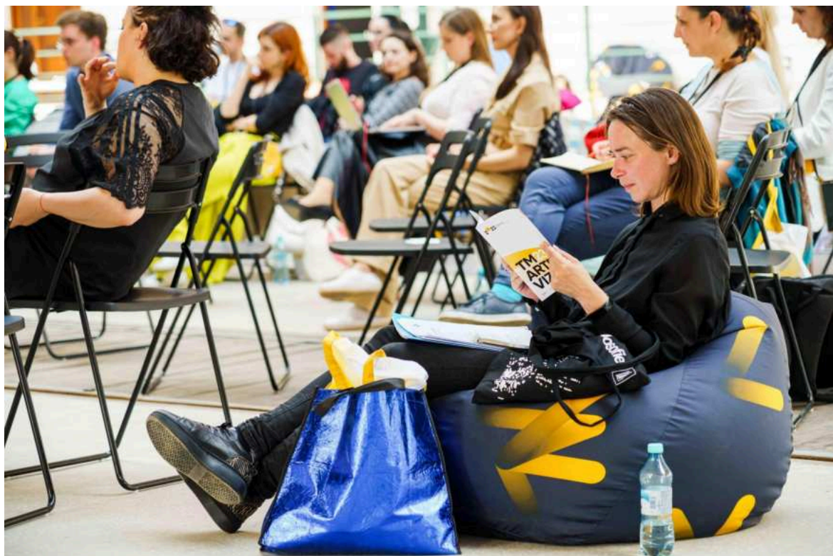
TM2023 Platform, at MX – Corneliu Miklosi Museum