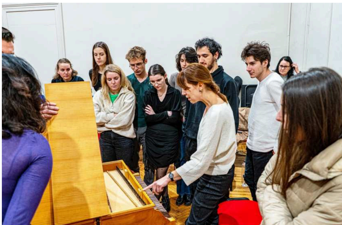
Schola Cantorum Timisiensis – "Timișoara Baroque Festival" Association, at the Faculty of Music and Theatre