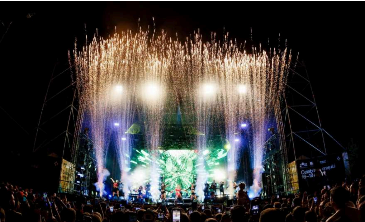
Rita Ora, City Celebration 2024

Conceived from its very first edition as a platform event that unites the city’s community of event creators and producers to showcase Timișoara’s unique strengths and its potential to host large-scale events, this year’s edition of City Celebration brought together 71 organisations active in the cultural, sports, and community sectors, along with seven of Timișoara’s best-known festivals.