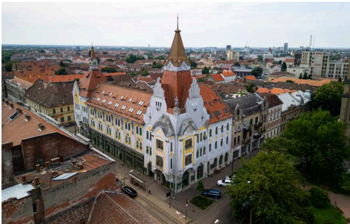
Ștefania Palace

In 2024, the Center for Projects of the Municipality of Timișoara facilitated access to the eight community spaces under its management and supported cultural operators and the wider community in organising 207 events, attended by over 35,000 people. The events hosted in these spaces spanned various fields—visual arts, theatre, music, education, social inclusion, and civic engagement—contributing to the diversification of the local cultural offer and expanding public access to events. Access to cultural, educational, youth, and civic events remains essential for community development, and the spaces managed by the Center for Projects provide an appropriate framework for such initiatives. The events held in these venues have strengthened the relationship between cultural operators and the public and have promoted active participation and cultural education.