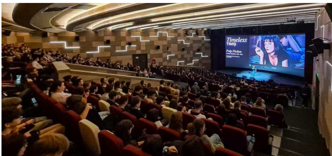
Cinema Timiș

Cinema Timiș has been member of the Europa Cinemas since 2024.