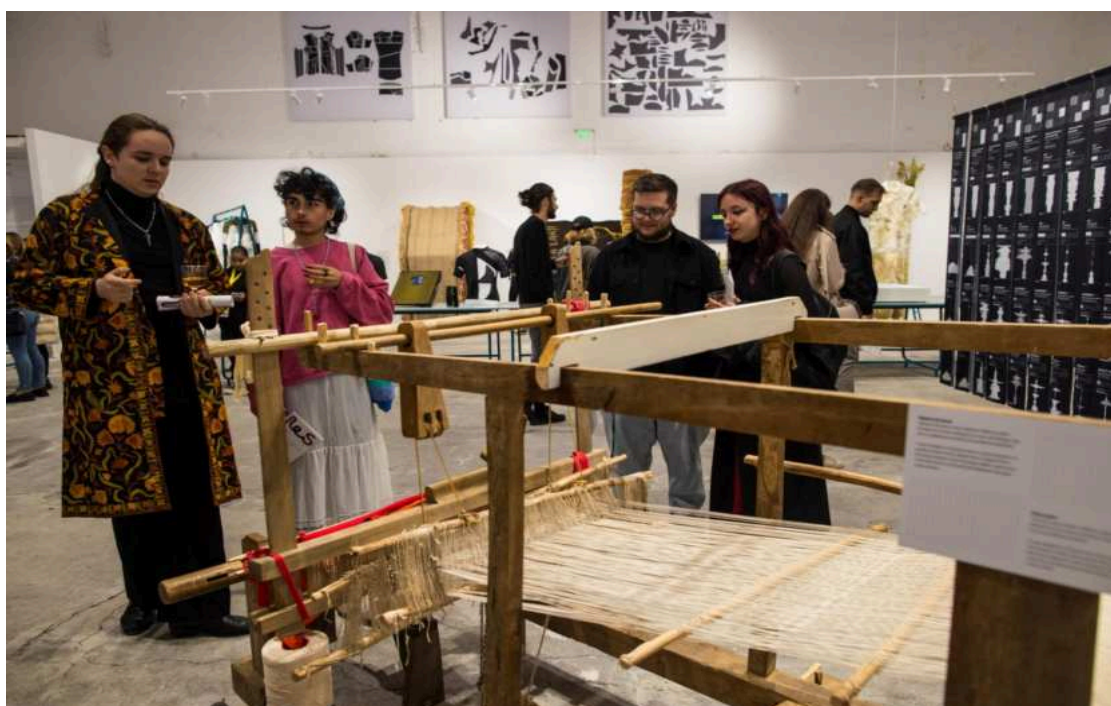
Woven secrets- Neighbourhood workshop – FABER Association, at FABER